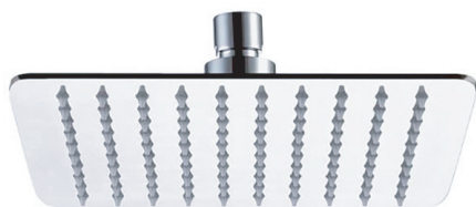
IMMAGINE - IMAGE